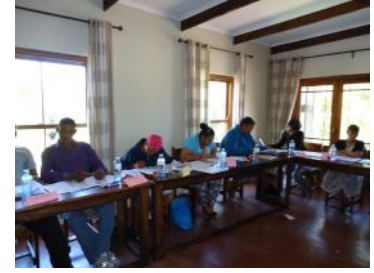
Workers busy learning at the workshop in Wellington