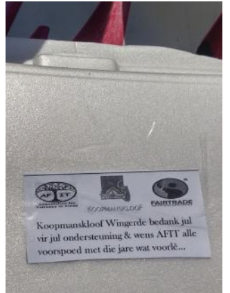
also had a nice message on their takeaway pack—above.