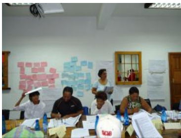
Everyone is very busy at the workshop in Citrusdal