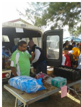
Fairhills sold cool-drinks out of their truck.