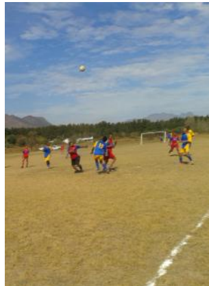
There was athletics for everyone. There was Rugby and