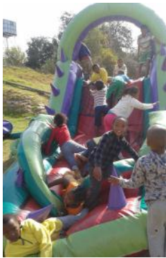
The crocodile jumping castle was a hot favorite!