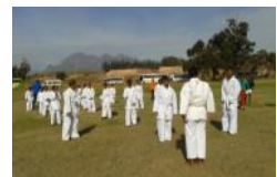
Bosman Adama Karate group did an amazing Karate demonstration for us all.