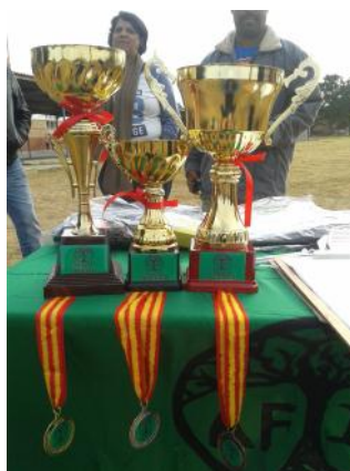
netball and trophies medals, Fairtrade badges and choco-