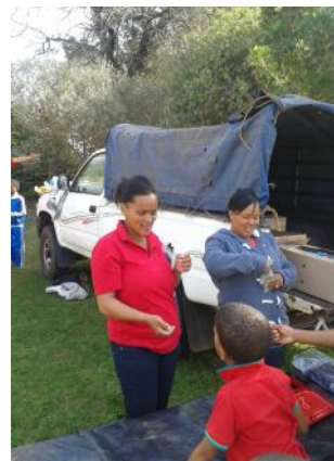
Rooidraai sold burgers droewors next to their truck.