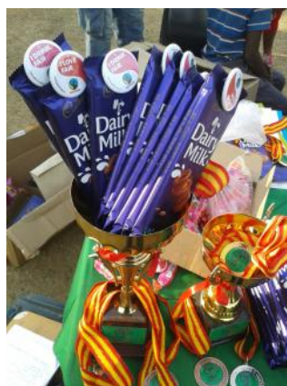
late 'Tjokolat' were the rewards!