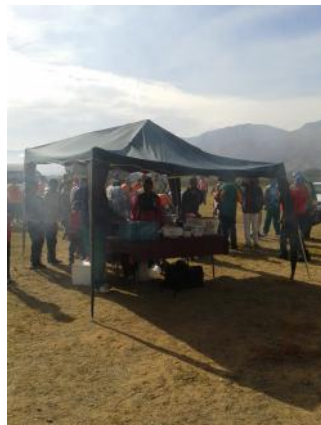
Saamstaan sold pancakes sweets, chips under their tent.

A very big thank you to everyone who worked so hard to make this day as big a success!