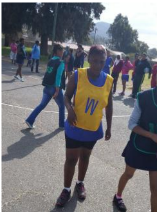
judged the dance competition. The women played brilliant

Farms had Athletics, Dancing, Rugby, Soccer and Netball Teams— everyone had a brilliant time!