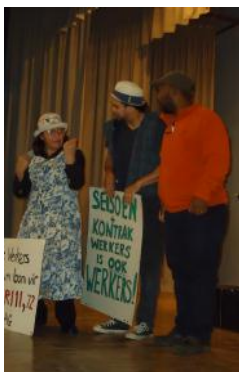
Ceres Performance of our play SAAMSTAAN

We are doing the final preparations for our last performance in Robertson. The performances in Wellington, Citrusdal, Ceres and De Doorns have been very well received by workers. From the evaluation forms, we found that the workers like the scene where the owner of the farm attends a meeting with the workers and that workers learned more about their rights and how important it is to work together. Workers, who attended the show, really enjoyed it.