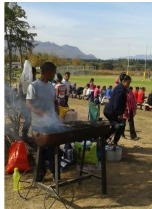
Koopmanskloof sold chicken lunches and ginger beer, they