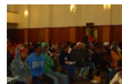
Ceres Audience at our play SAAMSTAAN