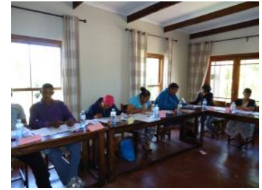
Workers busy learning at the workshop in Wellington