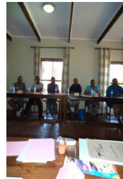
Participants at Wellington Workers Rights Workshop

Ons het in die werksinkels van mekaar se probleme gelleer en het werkbare oplossings gevind vir ons probleme gebaseer op Suid-Afrikaanse reg en die Fairtrade standaard . Almal stem saam dat dit 'n genotvolle tyd was en tyd goed bestee.