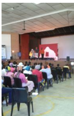
Wellington Performance of our play SAAMSTAAN