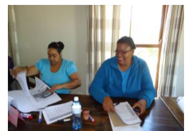
Participants at the Wellington Workshop share a joke