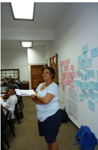
Denile listening to workers' inputs in Citrusdal.