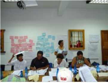
Everyone is very busy at the workshop in Citrusdal