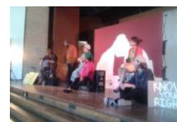
Wellington Performance of our play SAAMSTAAN