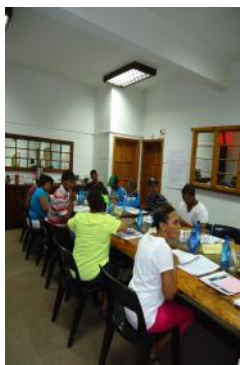
Participants at Citrusdal Workers Rights Workshop