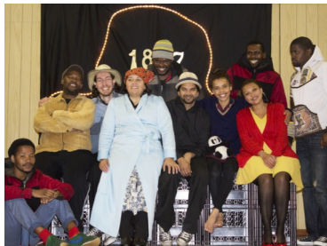
The cast of our play Saamstaan— don't miss it this time round!