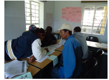
Deelnemers werk hard by ons lente skool verlede jaar.